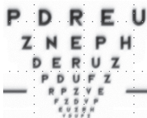
FIG. 2 Simulated retinal image for the same subject pictured in Figure 1. In this case, the individual is wearing a wavefront-guided scleral contact lens designed to target their specific levels of ocular aberration. The single bar indicates the 20/20 line.

The topic of wavefront-guided lenses has been under intense discussion for at least a decade and was the focus of a session at The 2 nd Annual International Forum for Scleral Lens Research. The session focused on the potential benefit as well as the practical challenges associated with wavefront-guided contact lens corrections from several different points of view. These include the perspective of the contact lens manufacturer,